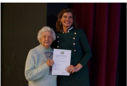
Tetney - 100 years