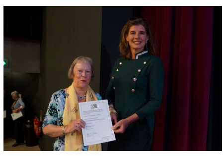
Binbrook - 75 years