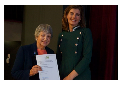
Hykeham Forum - 50 years