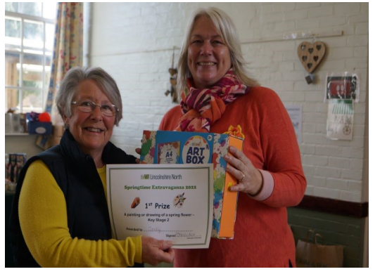
Far right: Just some of the fantastic blooms