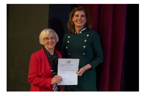
Manby & Grimoldby - 100 years