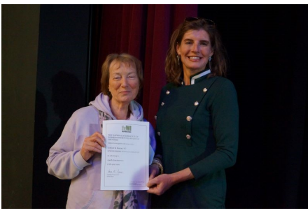
Tetford- 100 years