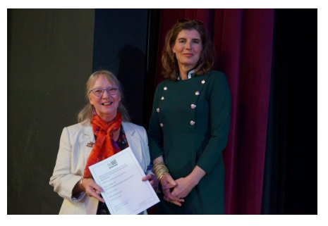
West Ashby - 75 years