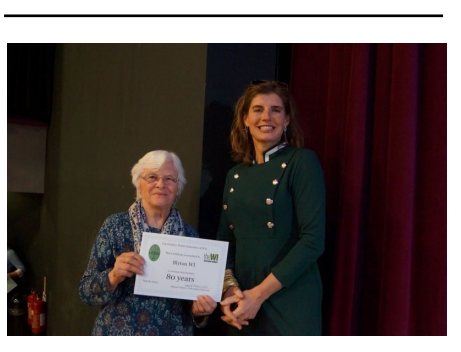
Blyton- 80 years